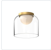
FM52508-BG/CL Brushed Gold/Clear